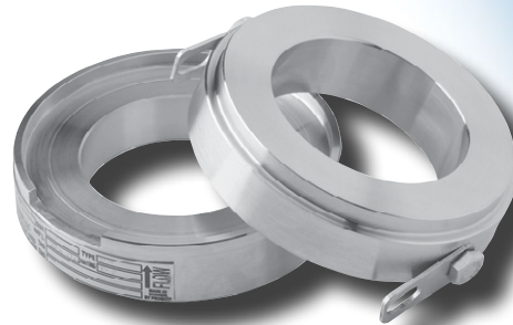
UHZ Disk Holder